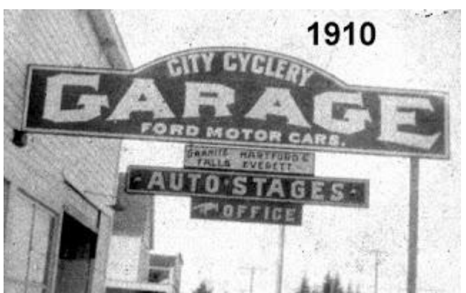
Ashe Brothers first shop was City Cyclery on Stanley St. It was a stop for the auto stage and sold motorcycles and cars.

During World War I, gas was rationed to ensure U.S. troops fighting in Europe had all the fuel they needed. Ashe Brothers customers lined up at the Granite St. service station.